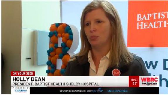
New name for Shelby Baptist Medical Center

Five local area hospitals will have a new name starting Tuesday ,February 4, 2025.